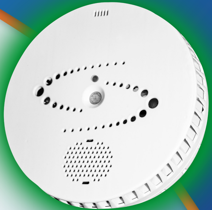
HALO Smart Sensor is Multi-Patented and Design is Trademarked

New security and environmental monitoring features provide users with even greater levels of security and easier installation. These features add to HALO's existing features of gunshot detection, noise alerts, and emergency keyword alerting.