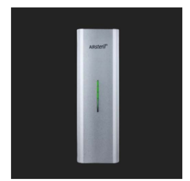
Multi Flex Air Purifier